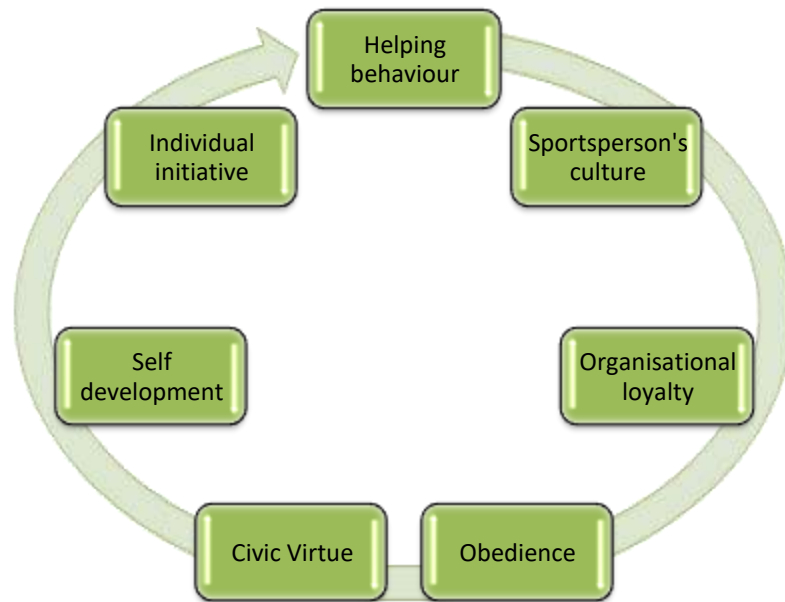
Figure 2. Podsakoff et al., Organizational Citizenship Behavioural Dimensions

Podsakoff et al., (2000) behavioural dimensions seems to be related to Organ (1988) five employees' behavioural dimensions. Thus the behavioural dimensions enumerated above can be reclassified as; Sportsmanship/sportsperson attitude, Altruism/helping behaviour, conscientiousness/organisational loyalty, obedience/courtesy, civic virtue, self-development, and individual initiative.