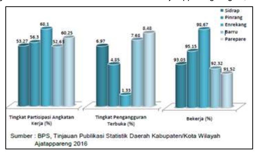
Figure 2. Labor Statistics of Districts/Cities in Ajatappareng Region, 2015

Human development as measured by the Human Development Index (HDI) is a combination of several components, namely component life expectancy, hope the old school, the average length of school, and spending. Fourth components of IPM are each showed an increase in the District and Cities of Ajatappareng Region from year to year, and HDI Parepare is the highest during the period 2013-2015. HDI level conditions in the area Ajatappareng can be seen from Figure 3 below.