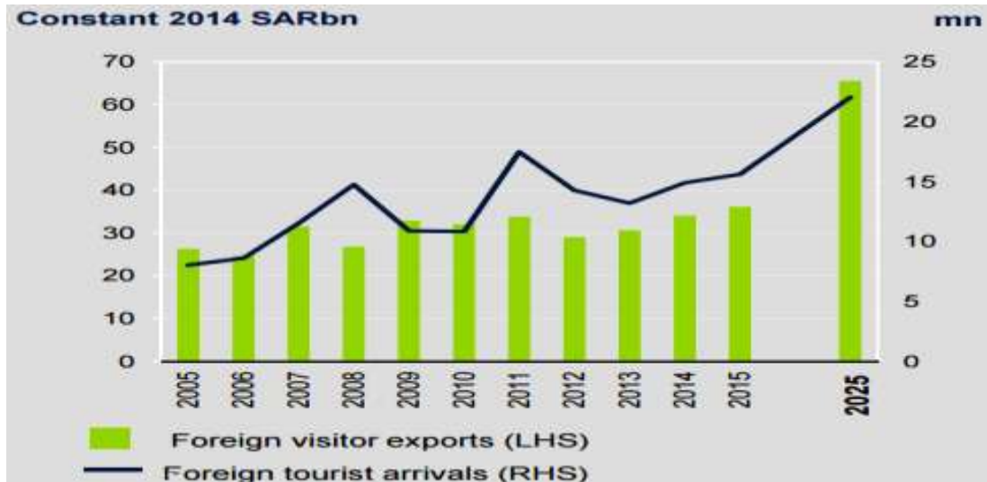
Figure 3. Visitor Exports and International Tourist Arrivals

Saudi Arabia, but they will not be detected as Umrah performers in the government e-Umrah system. The system counted kingdom's visitors those who come for performing Umrah only.